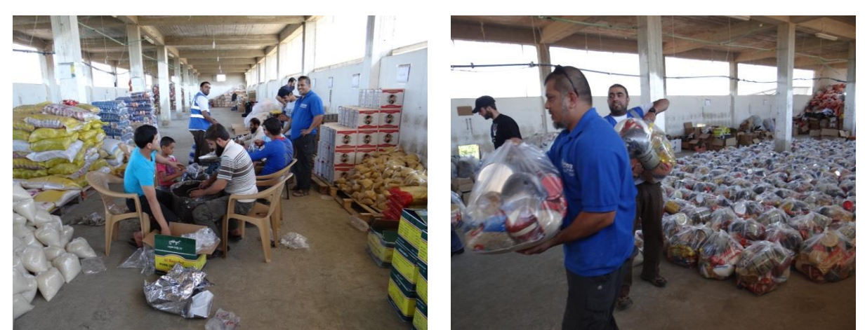
Food packs being prepared ready for distribution