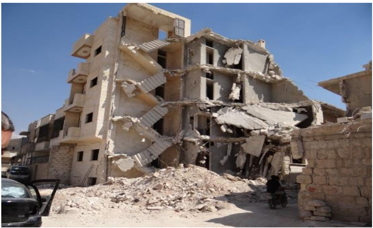
Housing destroyed in Marafat Numan – 20 people were killed in this building

Thousands of Syrian people have been leaving their own homes due to the ongoing crisis and seeking a safe place, many people have been gathering in the nearby villages on the Syria-Turkey border. However, due to the lack of enough infrastructure, many of them are under inhumane situation; no proper shelter, less food, no health services, etc. Basic foods items are among the most urgent and essential needs of the Syrian people.