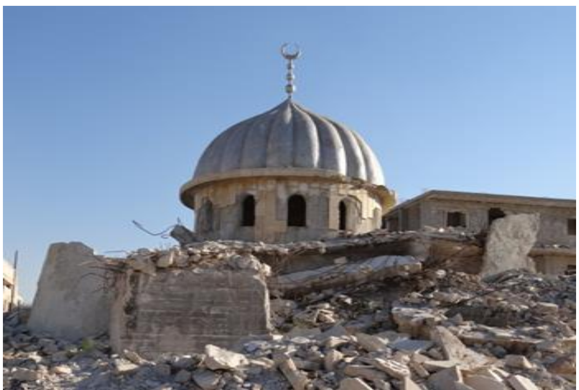
Masjid completely destroyed