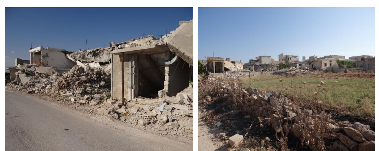
Town destroyed by the on-going conflict