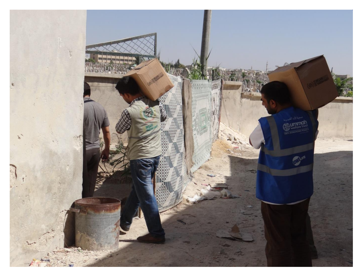
Door to door distributions in suburbs of Aleppo