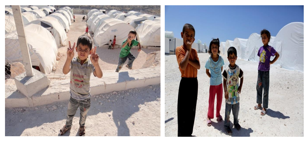
Children at the Ummah Camp