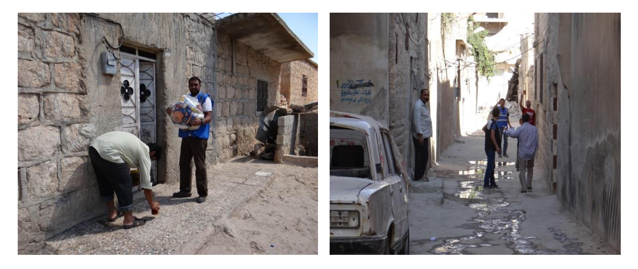
Door to door distributions in Marafat Numan

Many families have decided to remain in their homes despite being besieged by the regime forces. These families do not receive frequent aid therefore face many hardships. There are many families who are widows and orphans. Ummah Welfare Trust after completing an in depth assessment have identified these families in several towns, cities such as Aleppo, Marafat Numan etc. and have started delivering the much needed aid to these families.