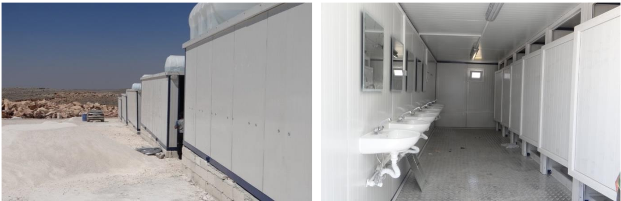
Bathroom & Toilet facilities