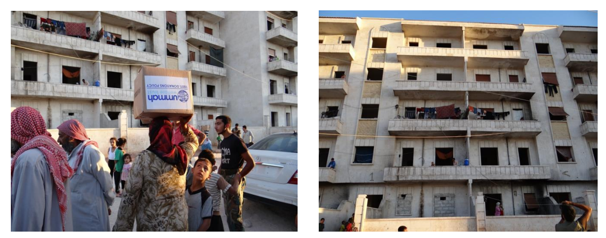
Food pack distributions in Aleppo