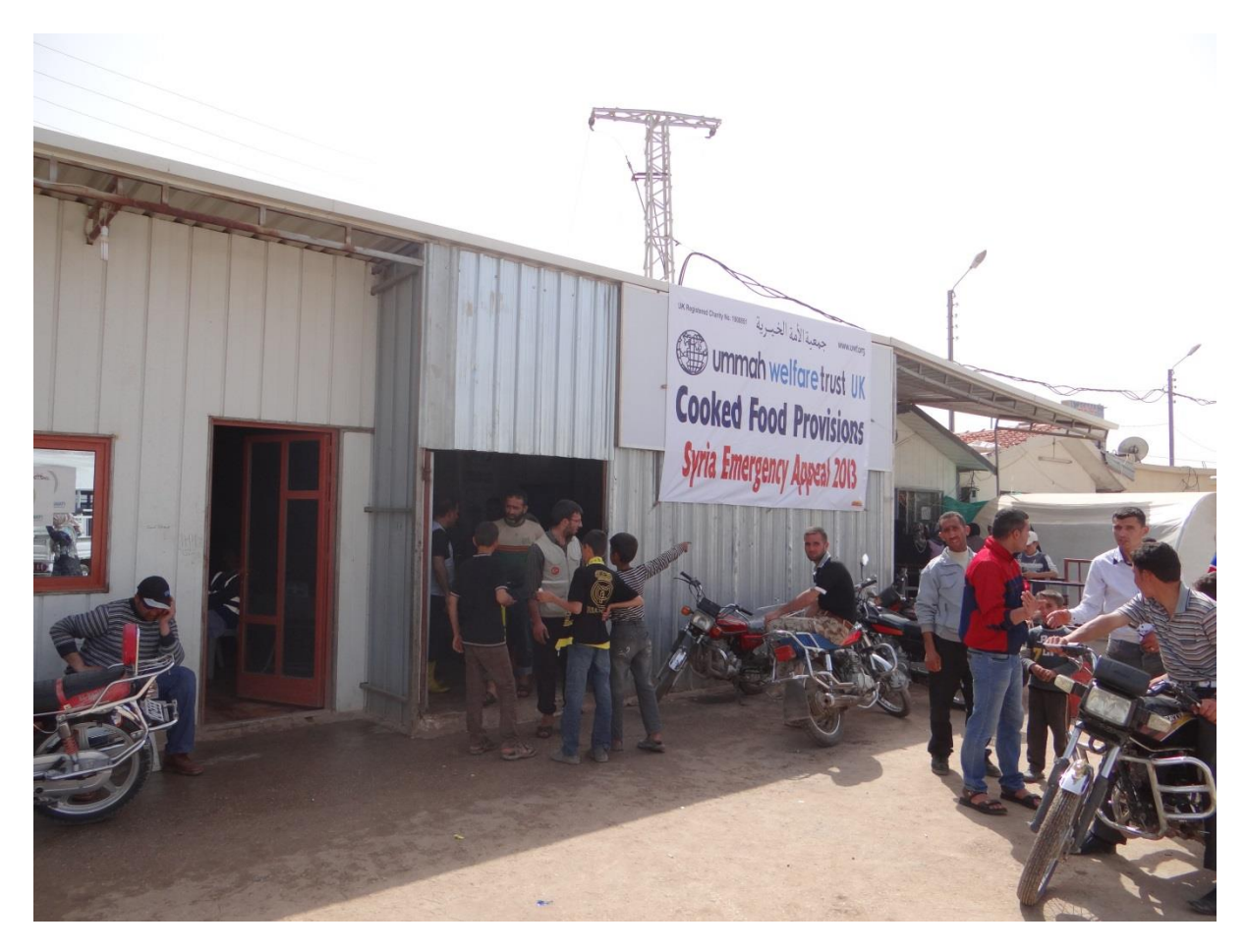
Ummah Welfare Trust cooked food programme for the Syrian refugees