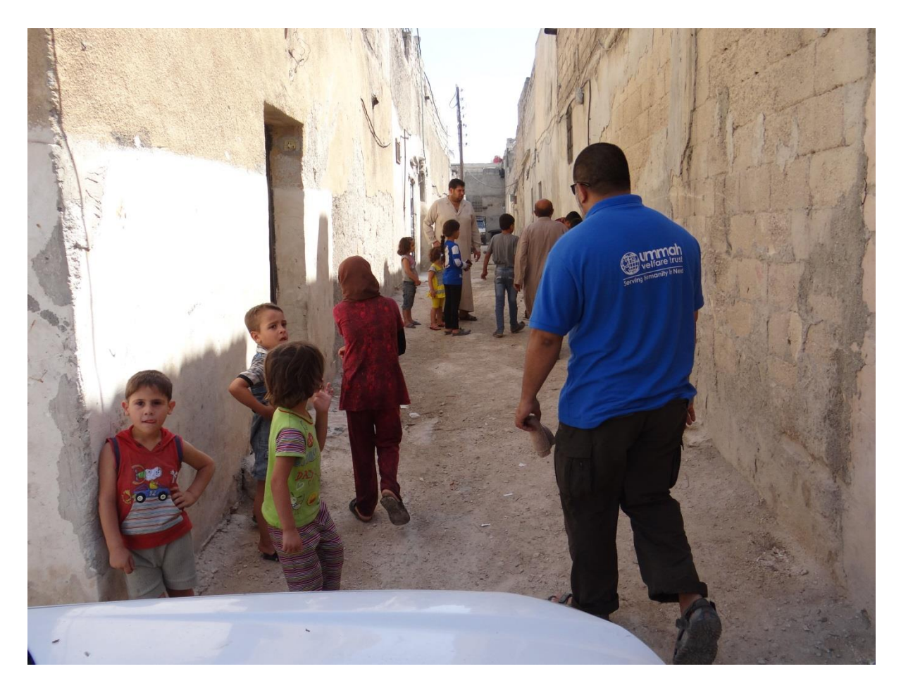
Door to door distributions in Aleppo